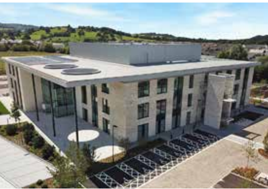
Ecclesiastical's office in Gloucester

As one of the UK's leading funeral plan providers and part of the Benefact Group, Ecclesiastical Planning Services works with funeral directors across the country, providing a safe home for your funeral plan pre-payment funds. The specialist UK-based financial services group of which Ecclesiastical Planning Services is part, has been protecting people, property and funds since 1887 and offering funeral plans since 2006.